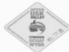
Beer mats to help area identity and encourage local spending

Sennybridge, Defynnog, Crai & Trecastle 2015