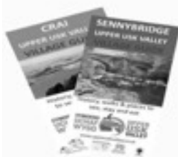
Update and reprint of area leaflets with history trails